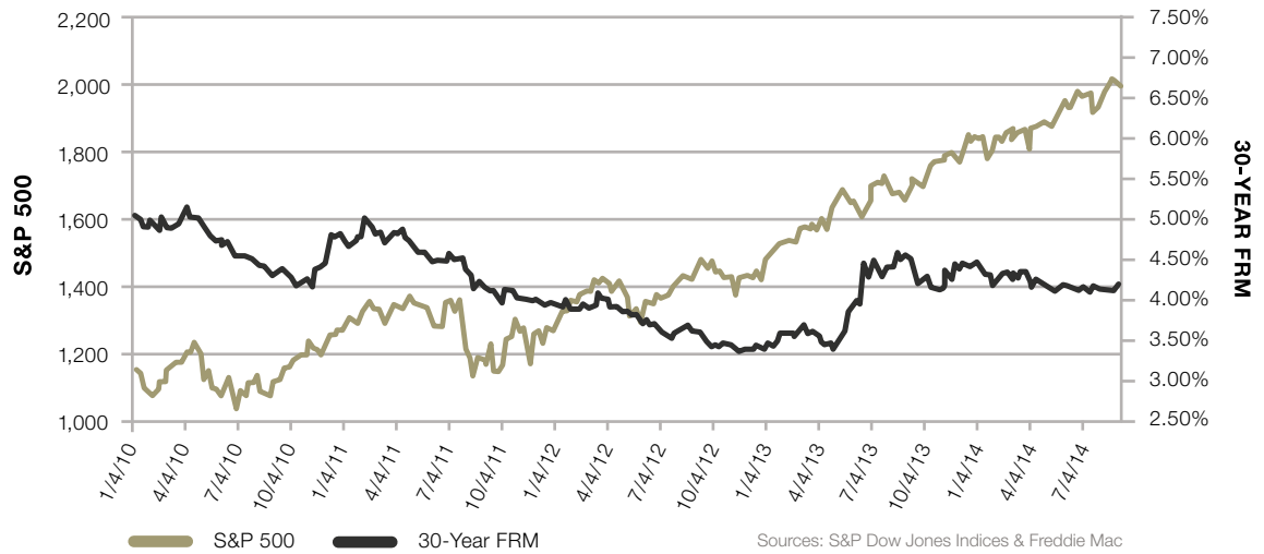
S&P 500 Stock Index and 30-Year FRM

*The following chart demonstrates fluctuations in the S&P 500 Stock Index as well as the 30-Year FRM on a weekly basis from 2010 through September 2014: